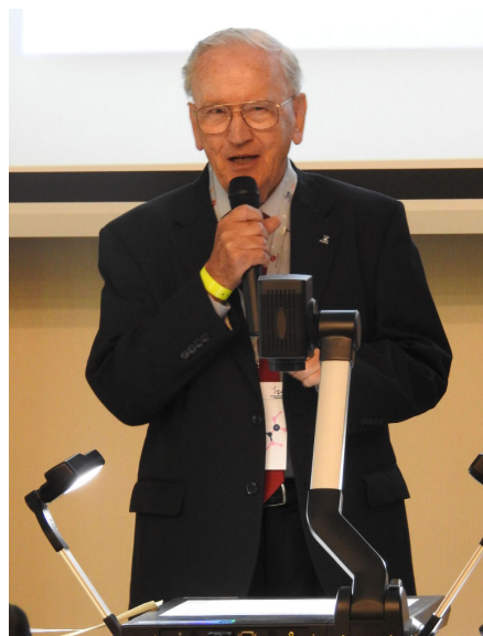
Prof. Maurice Manning, honorary guest of the Symposium.

The scientifically, high esteemed symposium provided a stimulating four days of peptide science, covered by nine plenary lectures and thirty-two oral presentations divided into nine sessions. The symposium's scientific sessions were devoted mainly to enzyme studies, peptide immunotherapy, peptide/peptidomimetic structure and synthesis, modulation of proteasome activity, peptide ligands and foldamers.