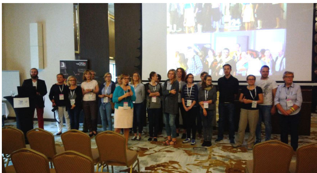
Organizing Committee of 24th PPS.