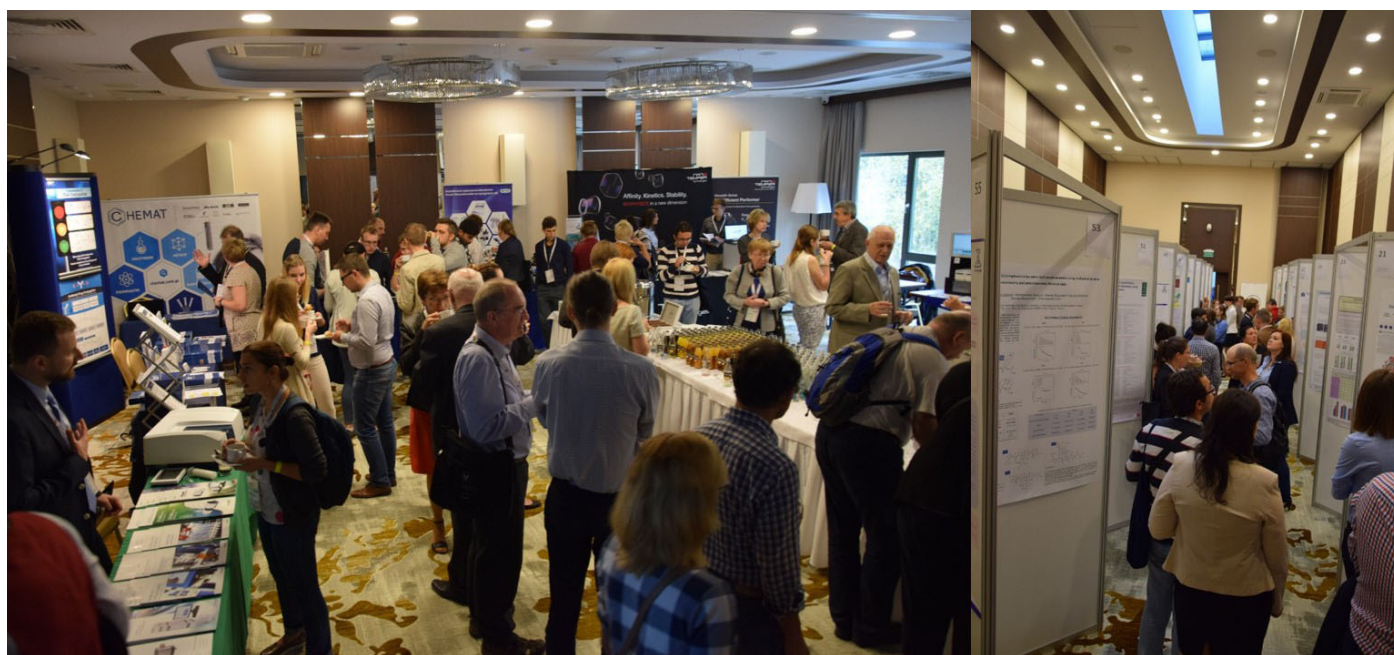
Discussions during coffee breaks and poster session.