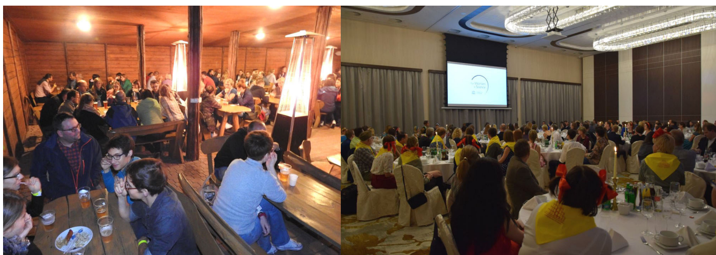
Social events: Welcome grill party and Conference banquet.

The challenge for the attendants was considerable, if one includes the lectures, the display of over a hundred scientific posters of high scientific standards, and the exhibition of twenty-two leading European and multinational providers of instruments, accessories, reagents and services in peptide synthesis, separation techniques, analytical peptide chemistry, custom synthesis, and the promotion of peptide and protein science and technology.