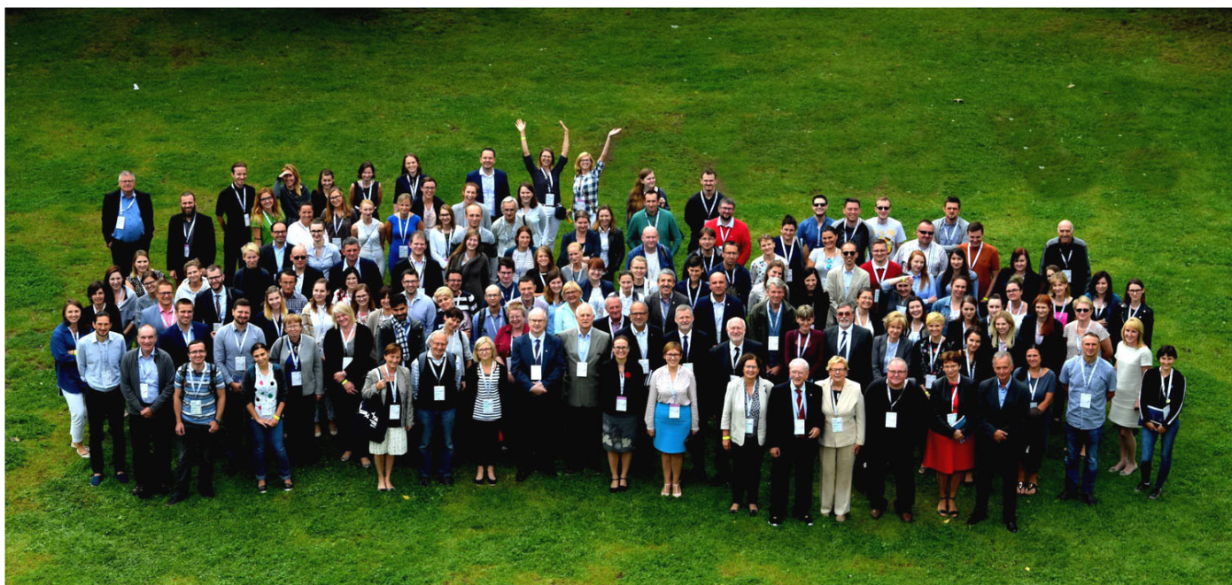
Group photo of 24th PPS participants.