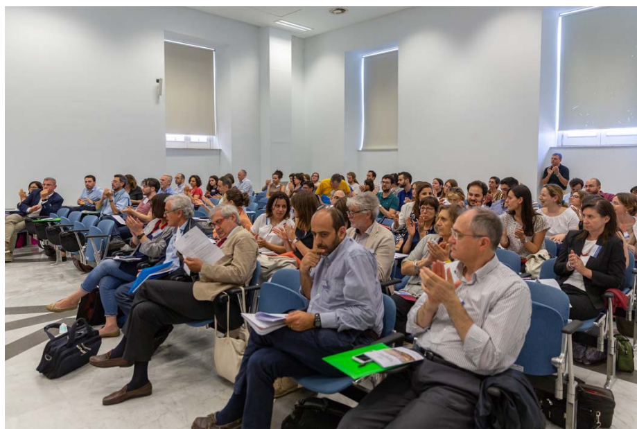
A view of the Conference Room during the Symposium.