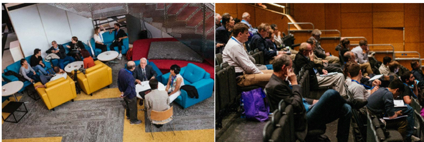
Participants of the 35th EPS in one of the Helix Foyers, where the coffee/tea breaks and exhibitions took place (left) and in the Helix Theatre, where the oral presentations were delivered (right).

peptide science during these sessions, the coffee/tea and lunch breaks, as well as the closing reception and the conference dinner. As for the 34th EPS, German delegates constituted the largest group of participants, followed by representatives from the USA, UK, France, Switzerland and Japan. Other Asian and European countries, as well as Australia and Canada were also represented among the participants. 33 exhibitors also took part in the Symposium.